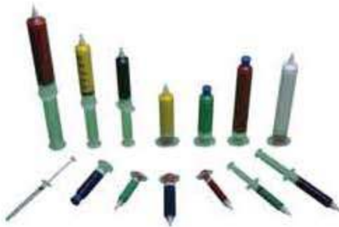
Air & manual syringes from Fisnar, Techcon, EFD Nordson, Fishman and B & D in sizes from 1cc to 60cc

Kitpackers stocks and packages a great variety of one component packages for precision dispensing.