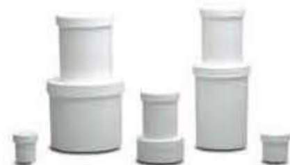
Plastic jars with lids from 1/2 to 32oz.