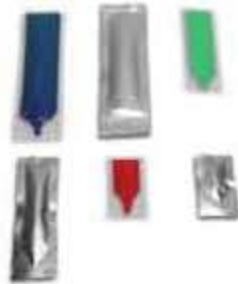
Flexible pouches made with clear and foil film in sizes from 2ml to 28ml.