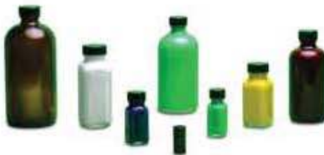
Glass bottles square and round in sizes from 4ml to 32oz and many with brush caps available.