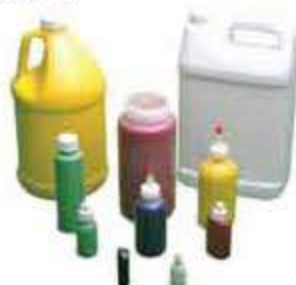
Plastic bottles from 7cc to a gallon.