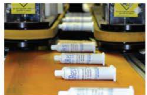
Extensive Labeling Capabilities