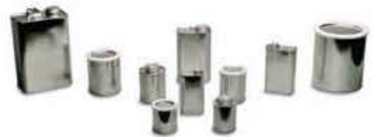
Metal cans round and rectangular some with brush caps 4oz to gallon.