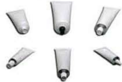
Aluminum tubes 1, 3, and 5.4oz also grease tubes 3 & 14oz (not pictured)