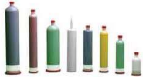
Disposable plastic cartridges for precision dispensing available in 2.5, 6, 8, 12, 1/10th gal, 20, 32oz