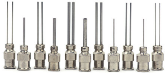
Custom lengths and diameters are available upon request.

This range of tips can be sterilized by an autoclave process for applications requiring sterile equipment.