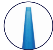
Standard Single Tapered UV Blocking