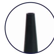
Single Tapered UV Blocking