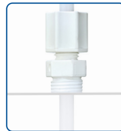
1/4" Tube Fitting

Can also be used with 710PT-U & 700PTPCW pinch tube valve & pen.